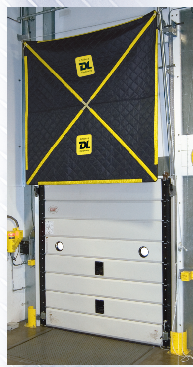
The Leveler Blanket<sup>™</sup> conveniently stores up and out of the way.