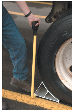
Easy to Place

Get a Handle on Dock Safety with Handy Chock™