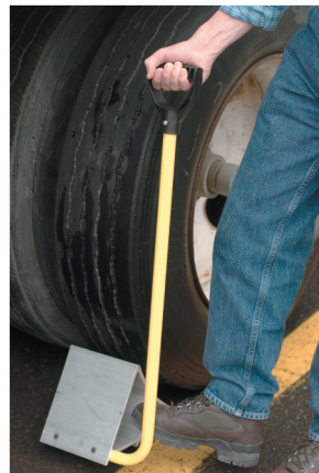
Easy to Remove