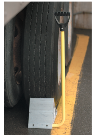
Easy to See